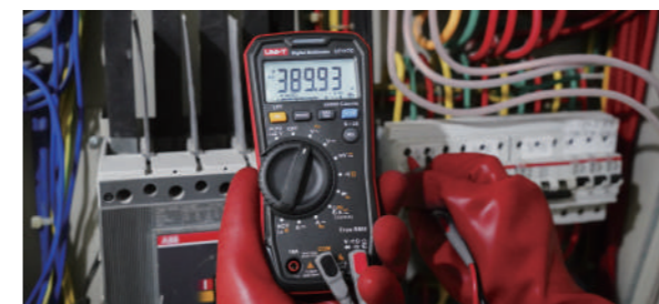
AC voltage measurement