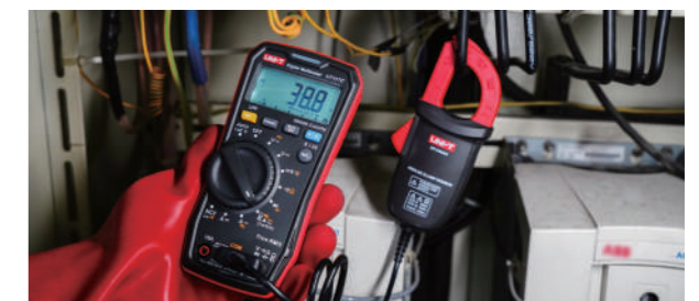
AC Current measurement